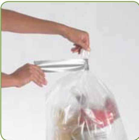
4. Repeat Step 3 with the outer bag.