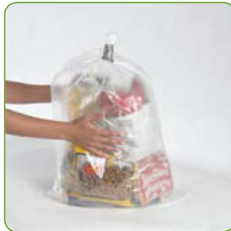
5. Check the seal by pressing gently against the sides of the bag and listening for air leaks. No air should be able to escape.