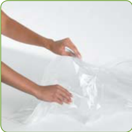
1. While bags are still empty place one inside another.

To ensure a tight seal, please follow these instructions carefully: