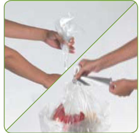
3. Twist the top of the inner bag, fold once and secure the fold in place using tape or a twist tie.